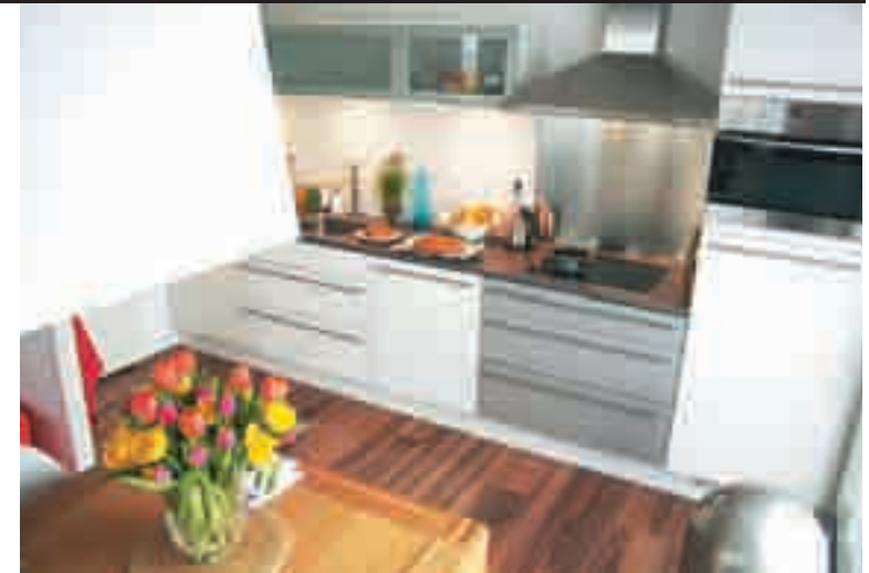
Is my stove in the right place?

in that the 5 Yellow has the characteristics of Earth and hence can be weakened by Water. However, water is an activating and accumulating factor and I personally would not like to activate and accumulate the bad qi of 5 Yellow. There are other ways to control the 5 Yellow, which are less dangerous. This would involve hanging a metal wind chime (preferably 6 rods, as 6 is Qian Gua in the Ba Gua which is Metal) at the West area.